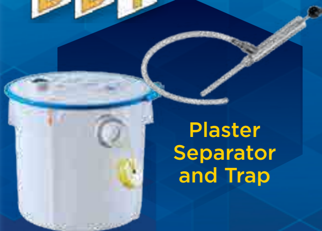
Plaster Separator and Trap